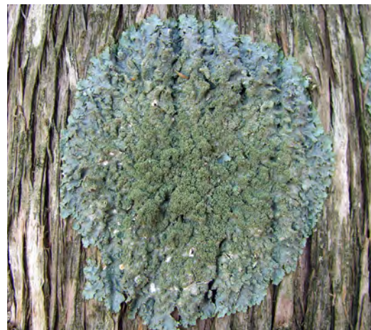
Rough speckled shield lichen ( Punctelia rudecta )