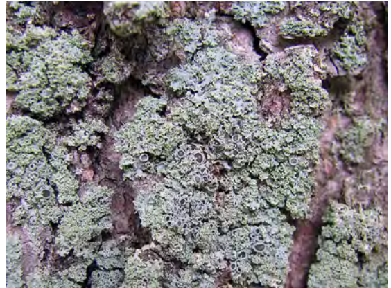
Mealy rosette lichen ( Physcia millegrana )