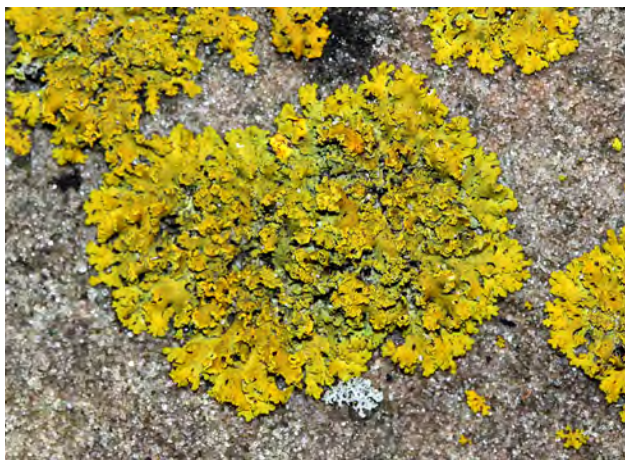
Candleflame lichen ( Candelaria concolor )