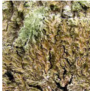
Bottlebrush frost lichen ( Physconia detersa )

—Henry David Thoreau Journal, Dec. 31, 1851