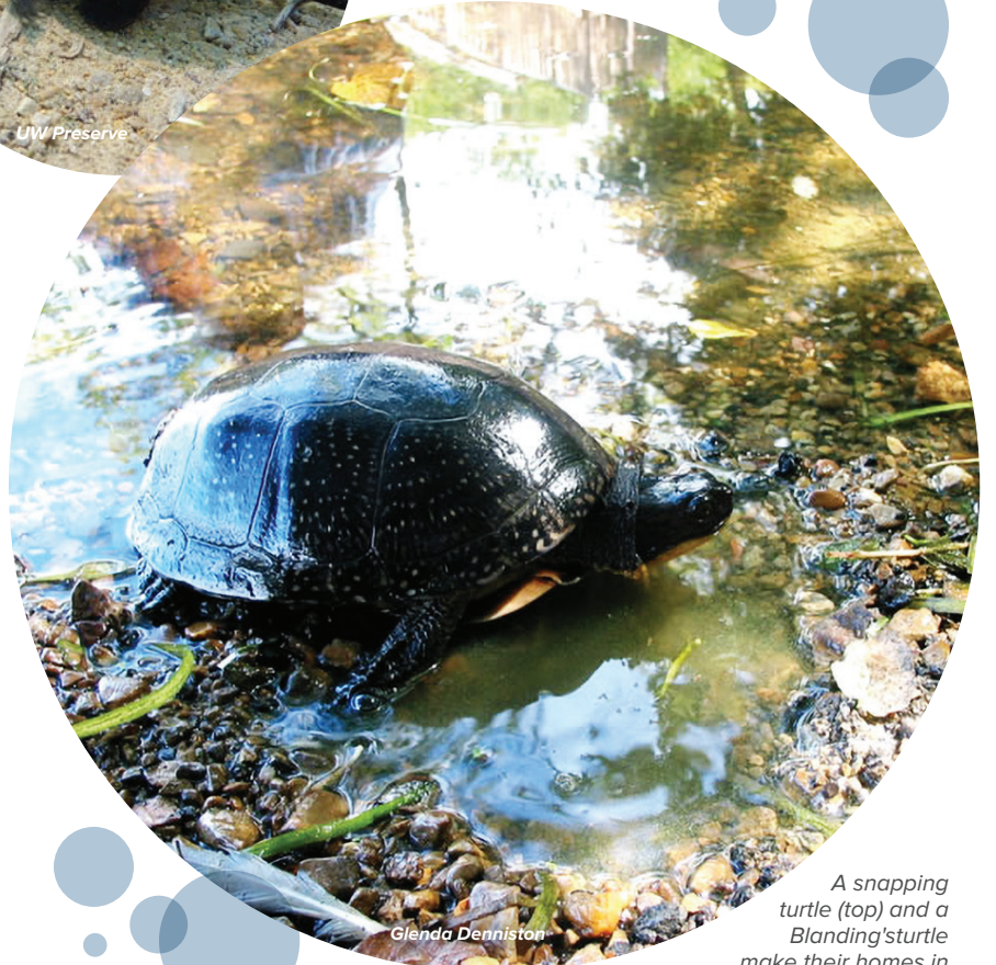
A snapping turtle (top) and a Blanding's turtle make their homes in the Preserve.